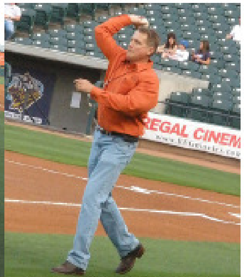
and throws out the First Pitch!

Williamson Co. Area Beekeepers Association 4335 County Road 110 Georgetown, Texas 78626