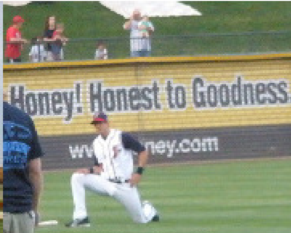
Outfield Signage Promotion