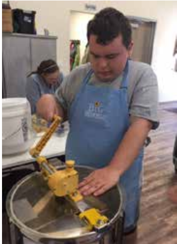
Extracting the honey frames

Now back to BiG and honey bees. The BiG Honey Company was launched because Erin loved the idea of BiG keeping bees and selling honey in the shop. With some grant money, five hives and colonies were purchased. Volunteers engraved the hive facings, then assembled the hive bodies and frames. The Citizens helped paint the hives. Several members of WCABA volunteer as BiG Beekeepers and care for the bees at their individual apiaries. The Citizens then harvest and bottle the honey which they