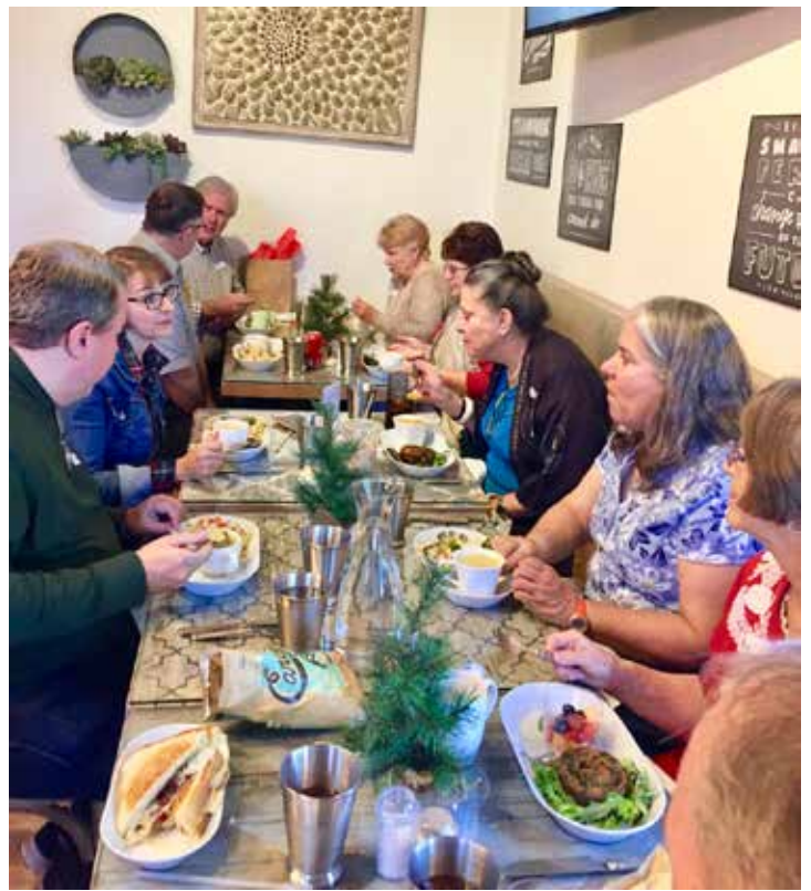
...and Finally Brunch, Oh, Yum!