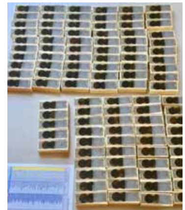
Marked & Clipped Queens for Requeening

The Bee Procurement Program has been a benefit provided to the membership for at least 20+ years and has become a hallmark of service of our club. The program has drawn many new members to our ranks because of the attractive pricing and the assurance of obtaining bees in an ever tightening and competitive market. For this reason, the club has increased the limitation on orders to 10 nucs total per family, and a limit of 4 nucs total for new members to the club.