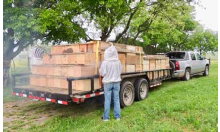
5-Frame Nucs from Merrimack Valley Apiaries in Louisiana

The 5-frame nucs will come from Merrimack Valley Apiary's winter location on Louisiana and are advertised to consist of a "laying" queen that has already been accepted by the hive, 3 inner frames containing brood in all stages, 2 outer frames containing honey, pollen and adhering bees, delivered in a sturdy wooden nuc box with full entrance and a top feeding port. The queen will be an Italian/Carniola Mixed Hybrid (Aurea- Karnica) that should provide a hardy, productive colony that winters well.