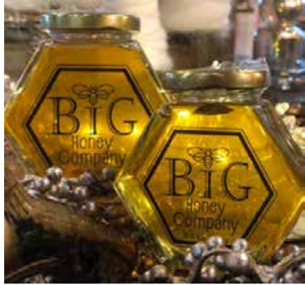
BiG Honey on the Gift Shop shelf

absolutely love to do. An additional source of honey is from beekeepers who donate a super of honey for the Citizens to extract. These are called 'Honey Friends'. The BiG Honey Company has received great support and generous donations for purchase of equipment and bees. The Rotary Club of Georgetown provided a grant for a large radial extractor this year. The BiG Honey Company looks forward to growing into that extractor. BiG appreciates everyone who has been a part.