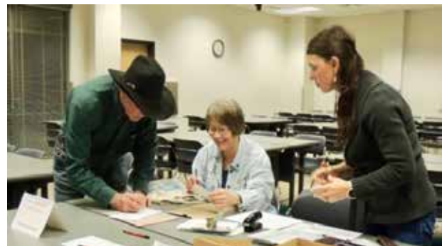
Taking B&Q Orders at the Beekeeper's Meeting

Orders will be accepted from current members at the club meetings and by mail through the end of February, or as long as supplies last. Each order must be on the official order form, be filled out completely, and be accompanied by the appropriate remittance to be accepted. All orders will be acknowledged by a confirmation e-mail and added to the Order Matrix by the Program Coordinator. Because of the need to track