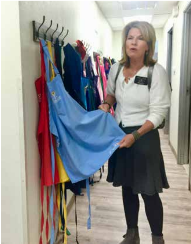
Apron Alley, where EVERYONE has their own personalized apron